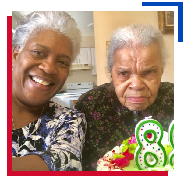
A-LIST: The Pulse of the Community 5

When dementia invades your family, as it did mine when my mom was diagnosed, you just feel so alone. You have no idea where to turn first or where to find good information. Thankfully, along came the A-LIST, which I believe is an important resource for those with dementia and their caregivers. It means everything to me because it allows me to have a meaningful voice. We are provided with surveys where we can say what matters most to us, both in caregiving itself and in clinical trials. We also have the opportunity to listen to podcasts for the most up-to-date information. We are allowed to read clinical trial results so we know what's happening now, and what will be happening in the future. I'm so grateful for the A-LIST, a place where I know I can turn, where I never again will feel alone.