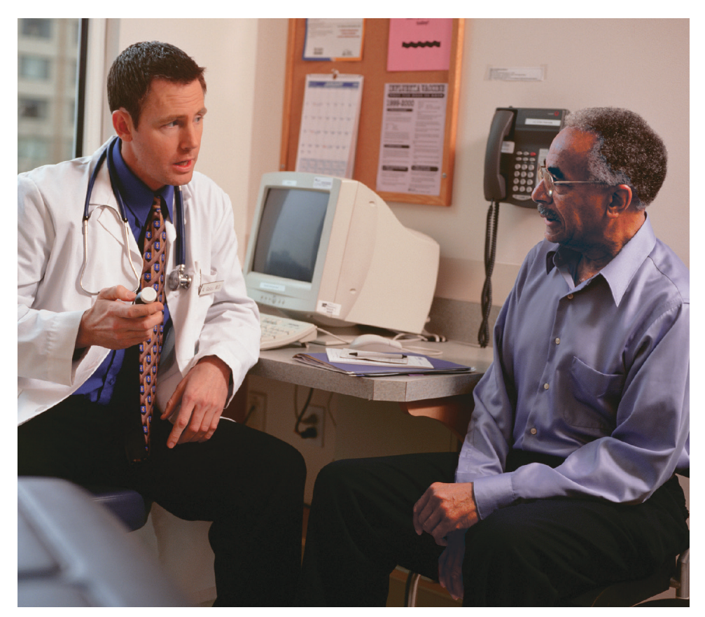
Some medicines can help treat the symptoms of Alzheimer's disease.

There are medicines that can treat the symptoms of Alzheimer's disease. But, there is no cure. Most of these medicines work best for people in the early or middle stages of the disease. For example, they can keep your memory loss from getting worse for a time. Other medicines may help if you have trouble sleeping, or are worried and depressed. All these medicines may have side effects and may not work for everyone.